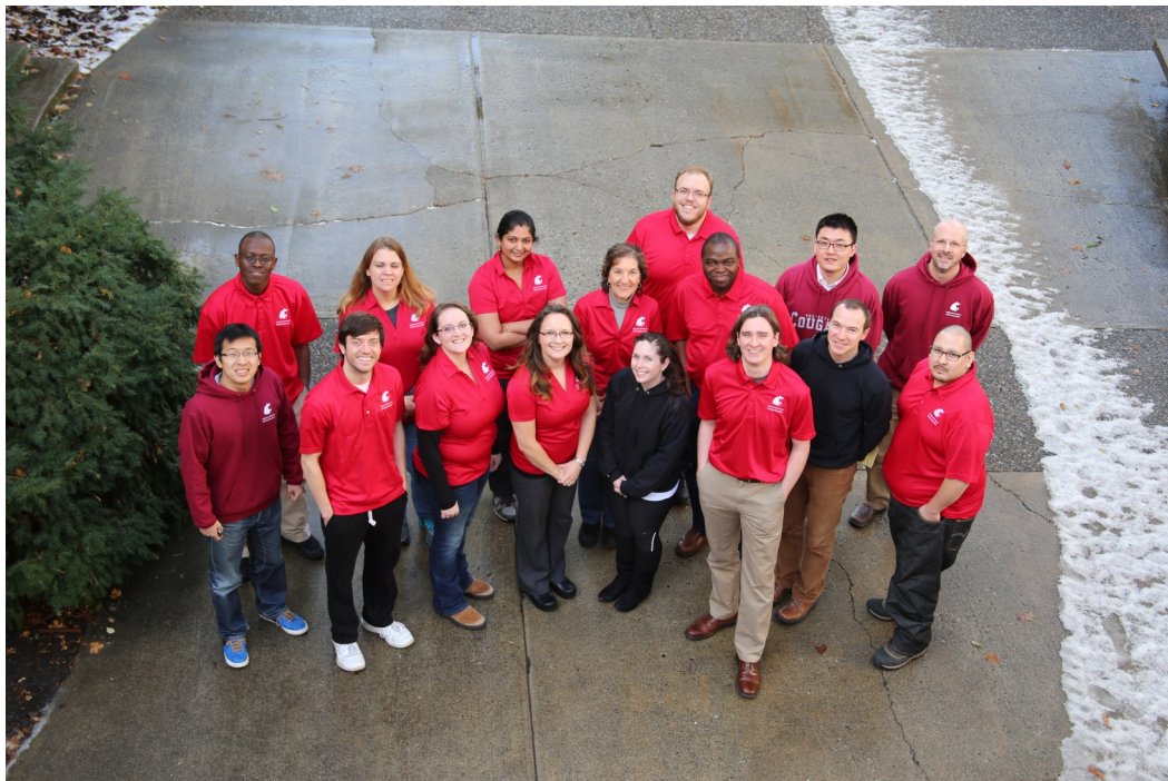
Some of our Ed Psych students and faculty, December 2014