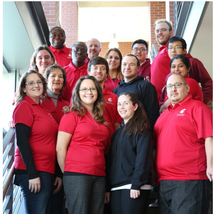
Ed Psych students and faculty, December 2014

ation, Oregon Department of Education, the American Education research Association, and Institute of Education Sciences. These projects involve topics from examining measures used in teacher evaluation systems across the nation, building local partnerships with education service districts, to continuing the educational technology conference at Washington State University.